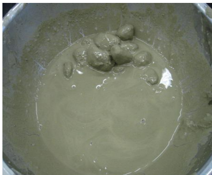
TG Parikku II Used Independently

Example of Use on Clod with a High N Value