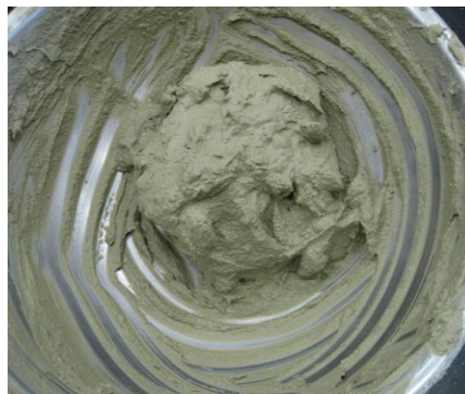
TG Parikku II + TG Gel Used Together

Capable of dispersing clod with a low injection rate